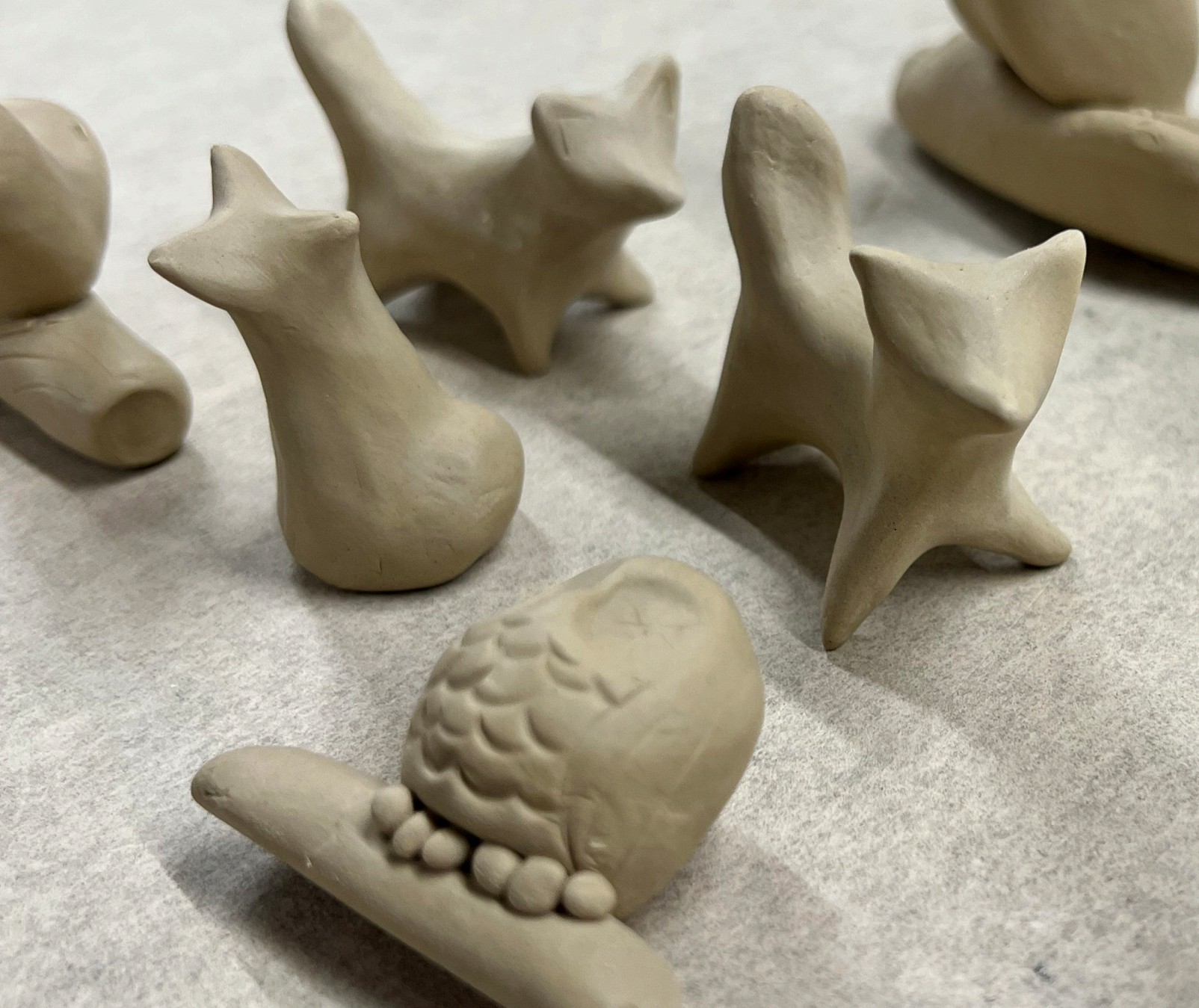
Samples from the Criters and Clay workshop at the Skyway Branch of King County Library System in December of 2022.