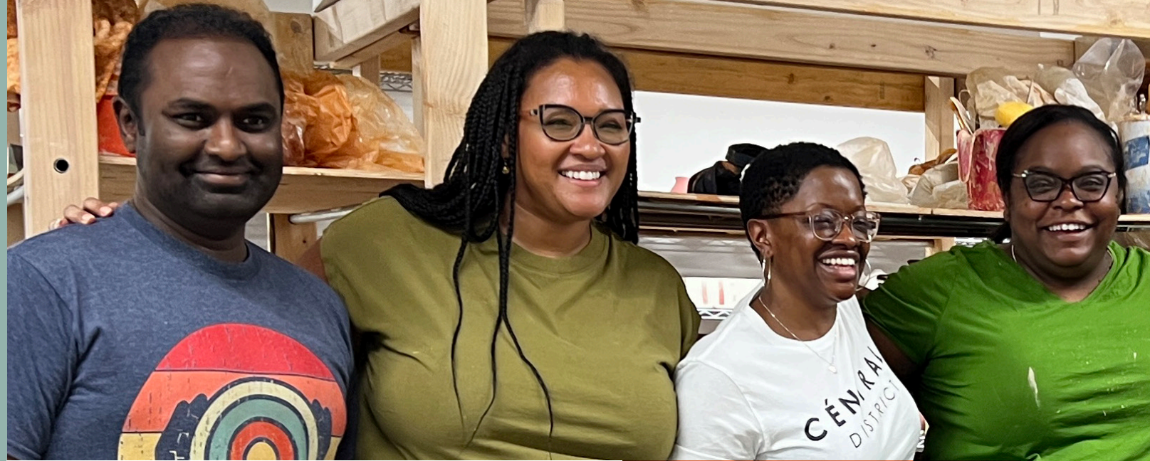
Urban League BIPOC clay night at Pottery Northwest