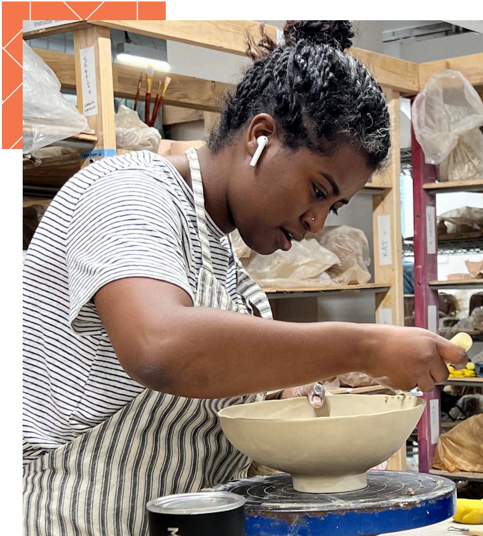
A student working in the handbuilding classroom

Our team is proud to contribute to the creation of jobs and financial vitality in King County's creative economy. In 2022, we were able to contract more teachers, studio techs, apprentices, and other part-time labor than ever before.