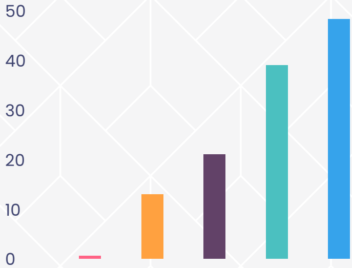
■ Winter: 0 ■ Spring: 13 ■ Summer: 21 ■ Fall: 39 ■ Winter '23: 48